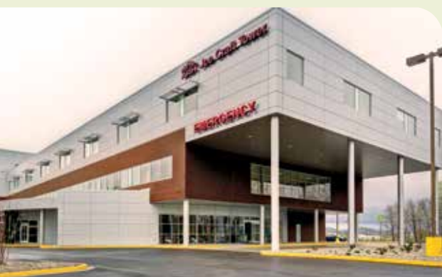
FOUNDATION PROJECTS: $47 million Joe Craft Tower on the campus of the Hazard ARH Regional Medical Center

An investment in ARH is truly one that offers a lifetime of rewards by enhancing healthy lifestyles and saving lives.